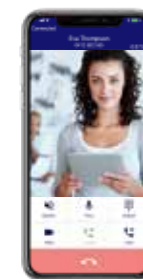
ST500 Mobile Client

*Handsets may have regional availability - check with your NEC reseller for further details