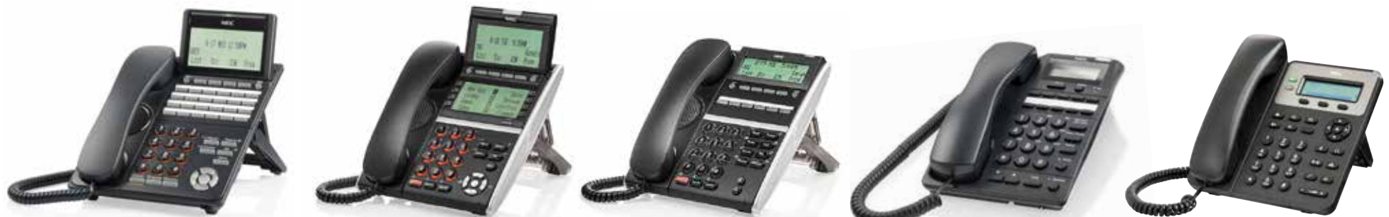
DT530 24 button