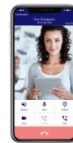
ST500 Mobile Client

*Handsets may have regional availability - check with your NEC reseller for further details