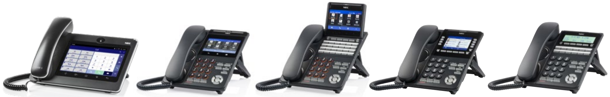
GT890 Video Phone