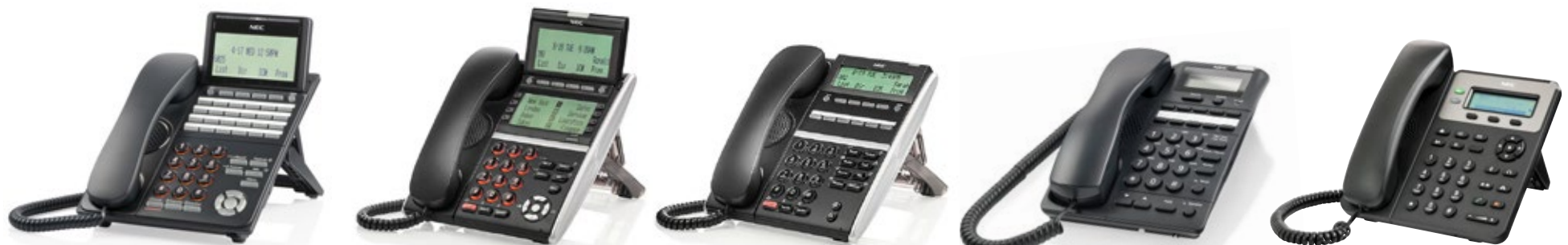
DT530 24 button